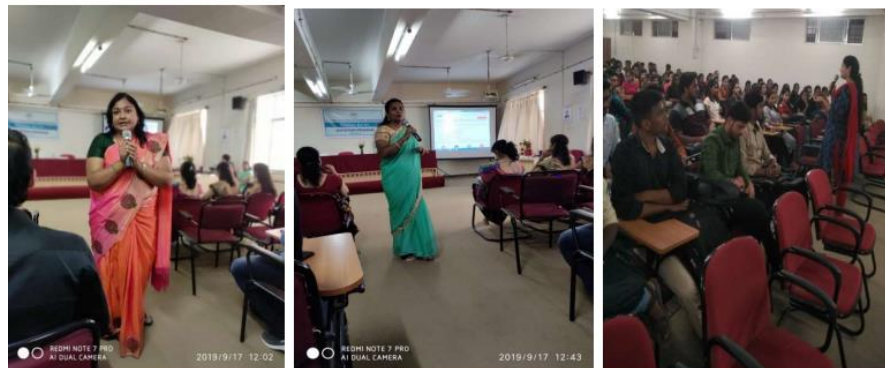
(Faculty Introduced Various Activities conducted in the institute)