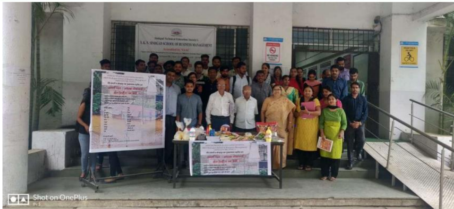
(Packaged Food, Food Grains & Daily Essential Collection- For Sangali and Kolhapur flood affected area)