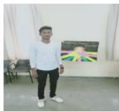
(Activities conducted on occasion of Women's Day)