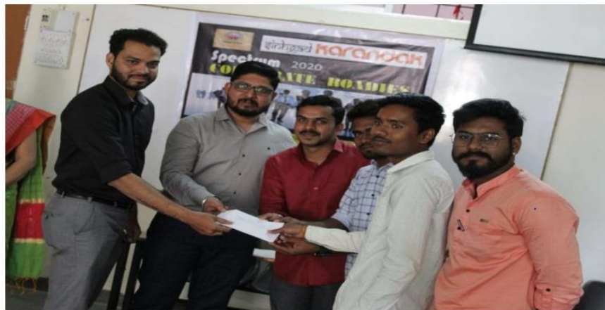
(Winner Team of Sinhgad Karandak)